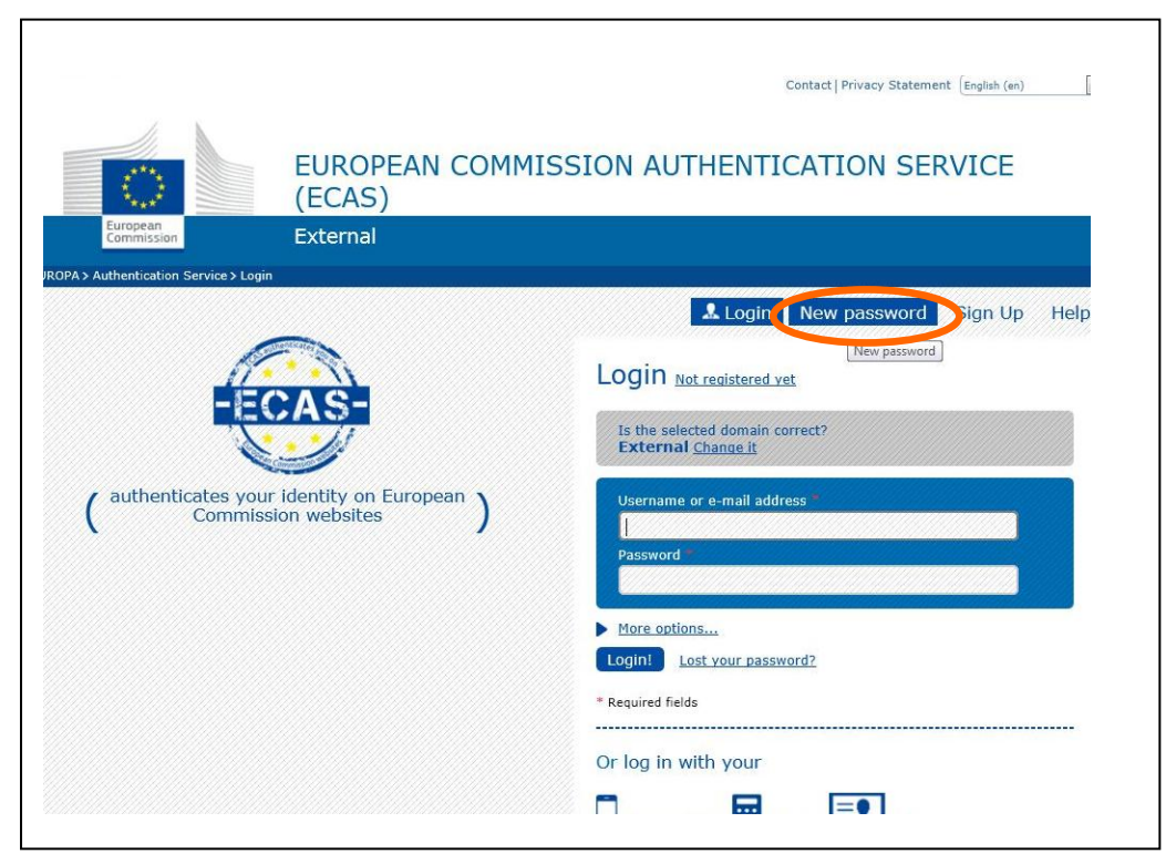
Figure 4: Creating or resetting your ECAS password